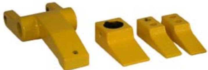
Model 16200 Upgrade Kit